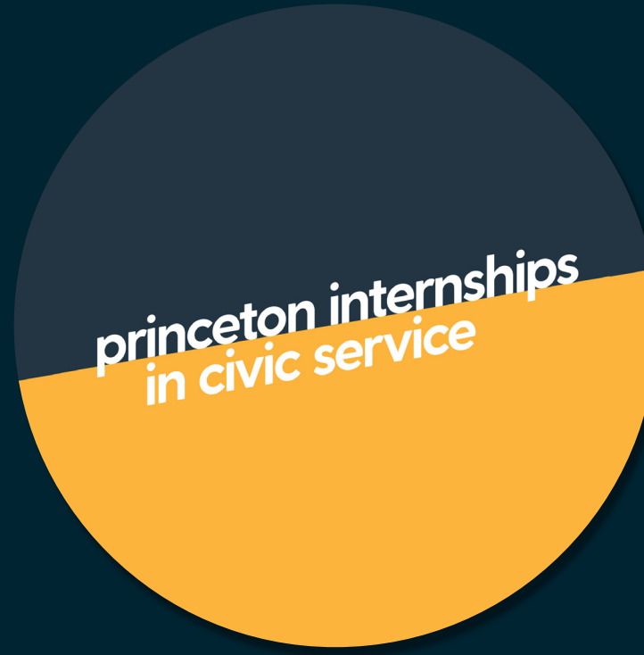
COMMUNITY SERVICE AWARD